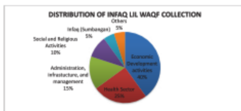
Chart 2: Distribution of Infaq lil Waqf Collection